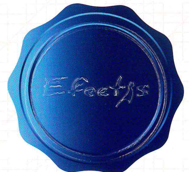
Operation Manager 22.08.2017

The justification of this Product Approval Certificate is recorded in Product Design File Inspection Report, nr. TDIR-S4F-002, dated 25.12.2012 and the Factory Production Control Audit Reports, nr. FUK-S4F-009 dated 07.12.2016, FUK-S4F-010 dated 22.12.2016.