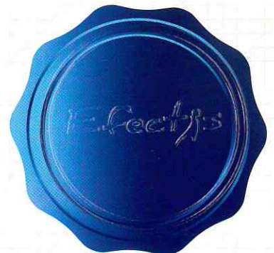
Operation Manager 22.08.2017

The justification of this Product Approval Certificate is recorded in Product Design File Inspection Report, nr. TDIR-S4F-002, dated 25.12.2012 and the Factory Production Control Audit Reports, nr. FUK-S4F-009 dated 07.12.2016, FUK-S4F-010 dated 22.12.2016.